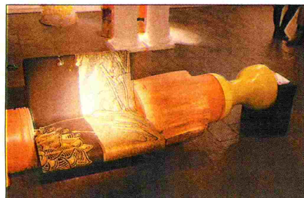
'FALLEN CONVERSATION'. A glowing artwork by Goet.