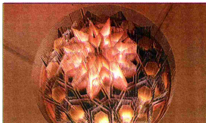
'MANDALA STUDY'. A lovely work by Willowlamp.