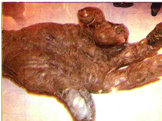
'GESTURE'. A bronze hand by Dylan Lewis.