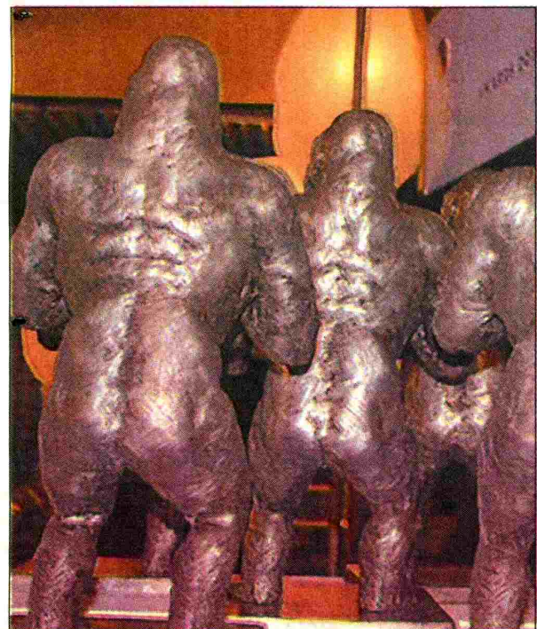
'WELCOME TO MY WORLD'. Statuettes by Bronze Age for the Southern Guild Foundation Awards.